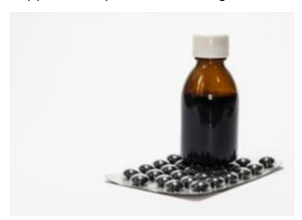
Suppressing a productive cough will only trap the virus in your lungs and risk infection

For the sake of your long-term health, you really don't want to suppress a productive cough.